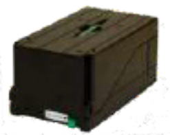
F56 Bill Dispensing with cash cassette Unit