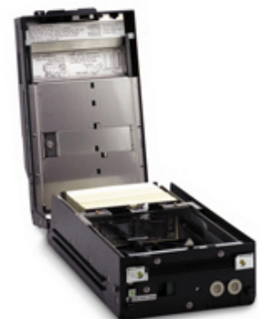
F400 Bill Dispensing with cash cassette Unit