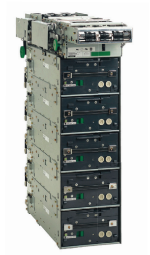
F510 Bill Dispensing Unit